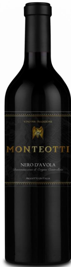
Nero d'Avola (DOC)