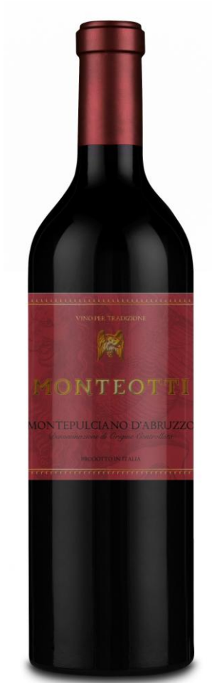
Montepulciano d'Abruzzo (DOC)