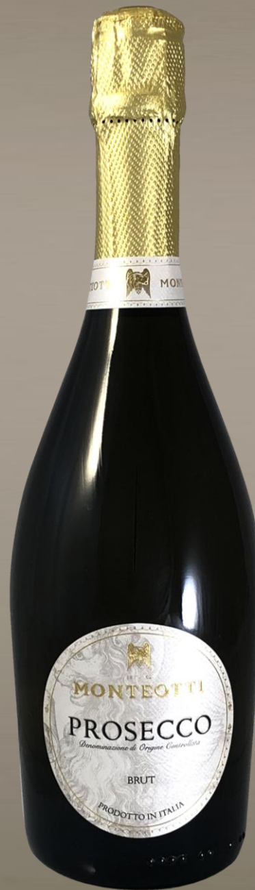
PROSECCO (DOC) – Available in BRUT (Sugar 9-11gr) and EXTRA-DRY (Sugar 15-17gr)