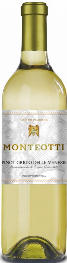
Pinot Grigio delle Venezie (DOC)