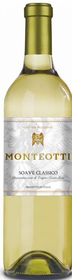
Soave Classico (DOCG)